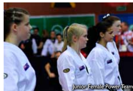
Junior Female Power Team