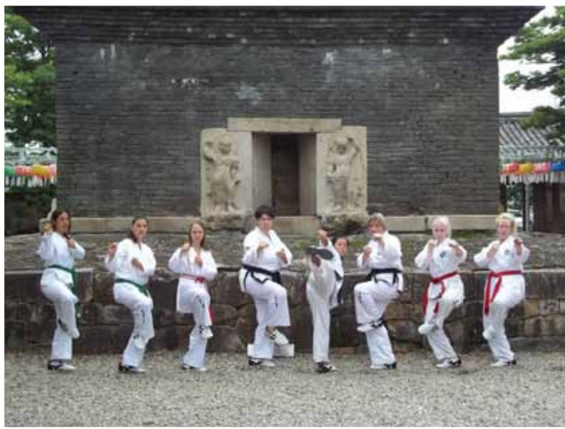
Girls in front of Won Hyo temple