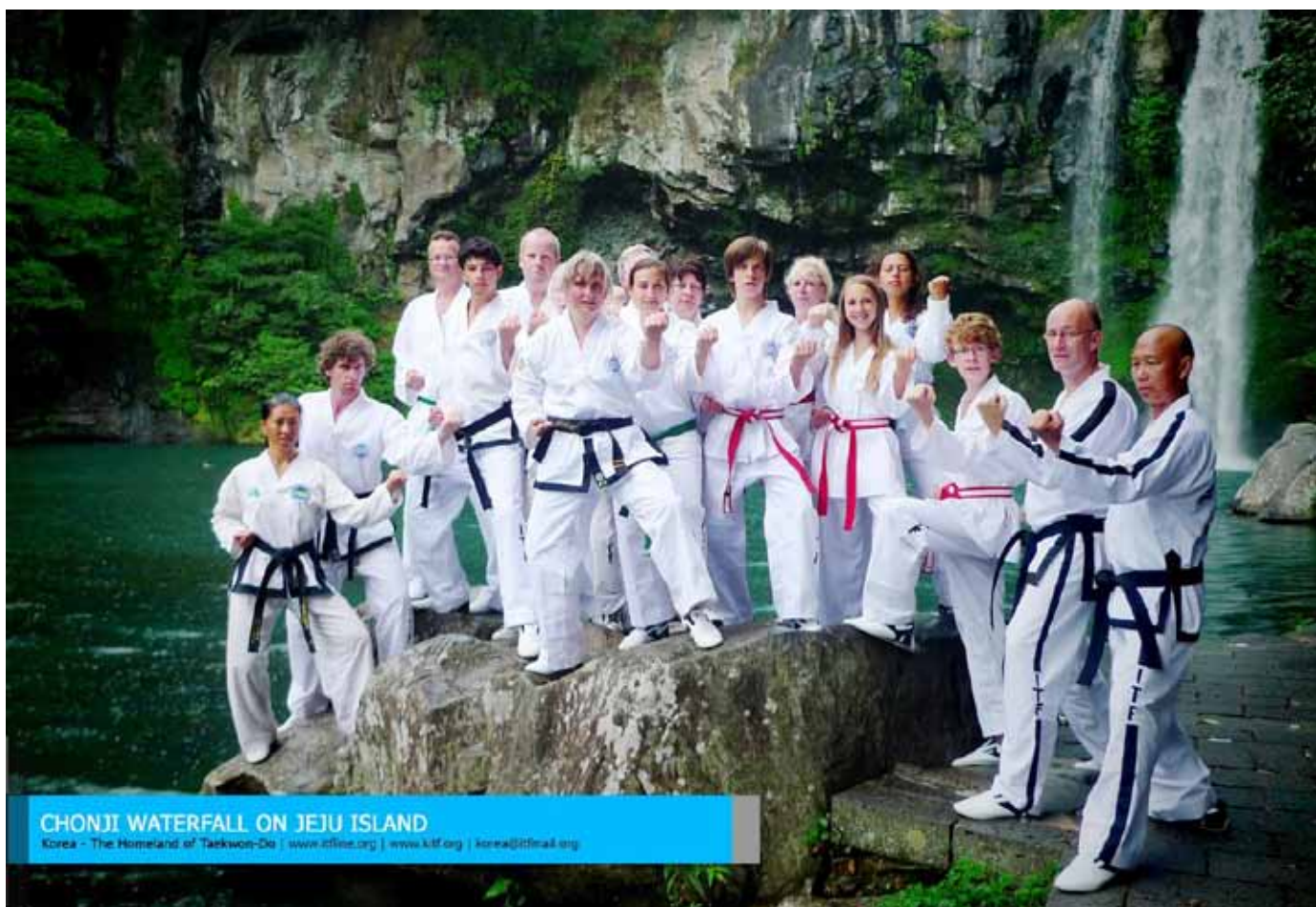
CHONJI WATERFALL ON JEJU ISLAND

Korea - The Homeland of Taekwon-Do | www.ittf.org | www.kiff.org | korew@ittfmail.org