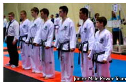
Junior Male Power Team